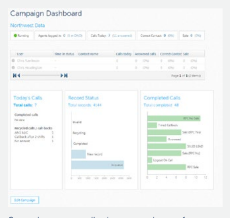
Supervisors can easily view campaign performance